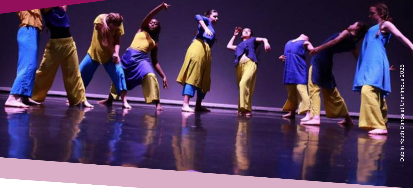
Dublin Youth Dance at Unanimous 2025